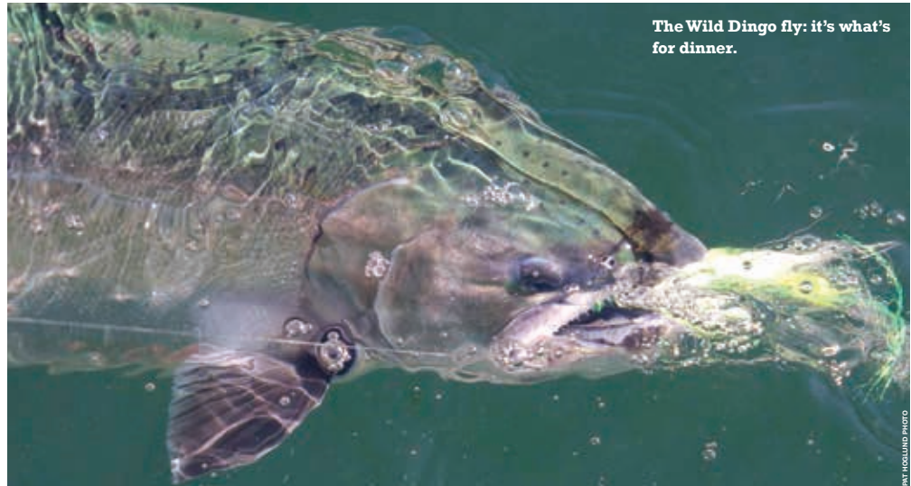
The Wild Dingo fly: it's what's for dinner.

Silvers have a tendency not to be in any one particular place. They travel in schools and follow the baitfish. That's the best advice I can give you when it comes to locating places to fish. A telltale sign that salmon are schooling is to locate seabirds. If you see seagulls, murrelets, or murrelets, or other sea birds in flocks near the water, you can just about bet the house there are bait fish