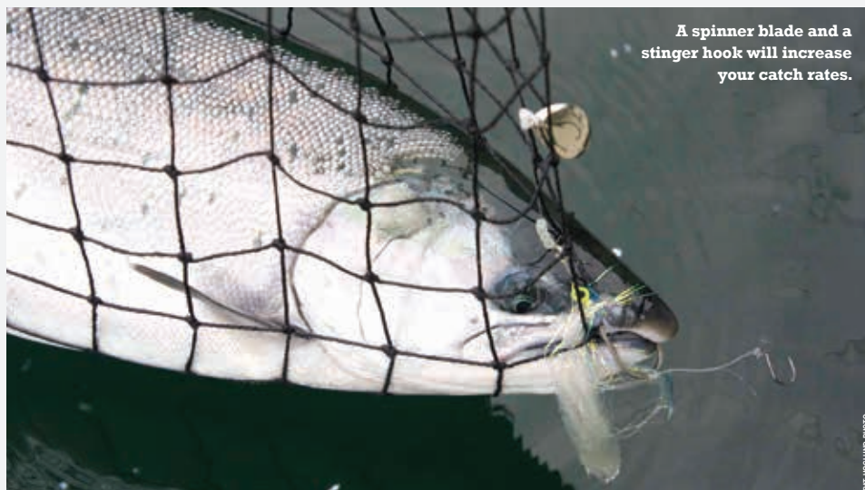
A spinner blade and a stinger hook will increase your catch rates.

are like cats. Pull a string across the floor and a cat will give chase. Coho are similar in so many ways. For the sake of curiosity they will chase a fly in the water. But something needs to first get their attention. That's where the motor's wake comes in. By raising the pitch of the motor, and running at a slow to moderate speed, the prop wash is enough to get a