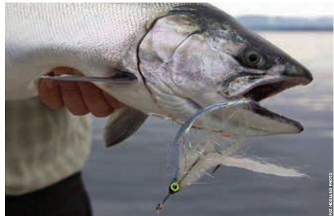
Coho salmon are like cats: they will chase anything big and colorful.

Of course it helps to fish in places like Rivers Inlet where massive numbers of silvers are returning. We spent a lot of time close to the ocean, which happens to be one of Legacy Lodge's finer traits. Among many others, I might add. Within 20 minutes you can find yourself at Double Cut bucktailing flies where ocean-fresh silvers are on the prowl for a quick, easy and interesting meal. And that is something I find hard to beat. SSJ